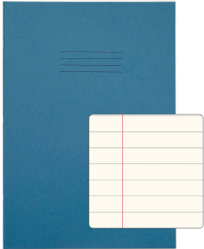
RHINO A4 Cream Tinted Exercise Book, Lined with Margin, Pack of 10

We are delighted to announce that our RHINO tinted paper range has been awarded the Stationers’ Warrant, a formal recognition awarded to companies that supply stationery of exceptional craftsmanship, quality, and service.