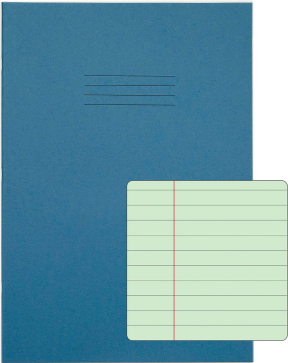
RHINO A4 Green Tinted Exercise Book, Lined with Margin, Pack of 10